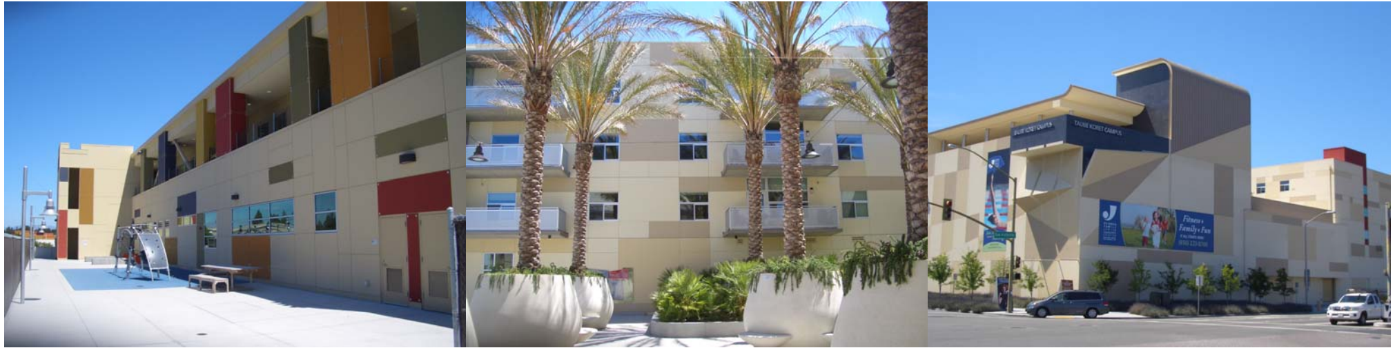
Taube Koret Campus for Jewish Life – Palo Alto, CA