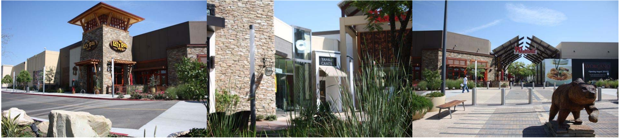
Valencia Town Center – Valencia, CA