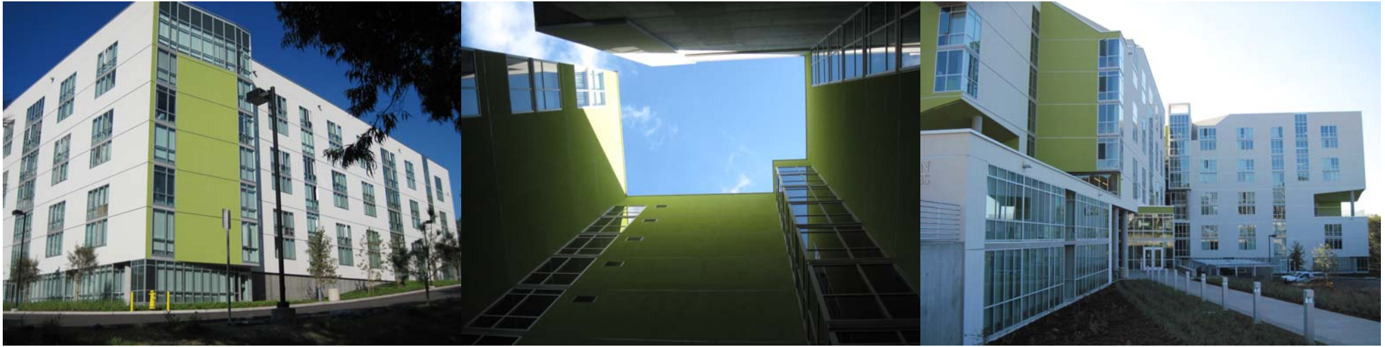
University of California, San Diego - Rita Atkinson Residences – La Jolla, CA