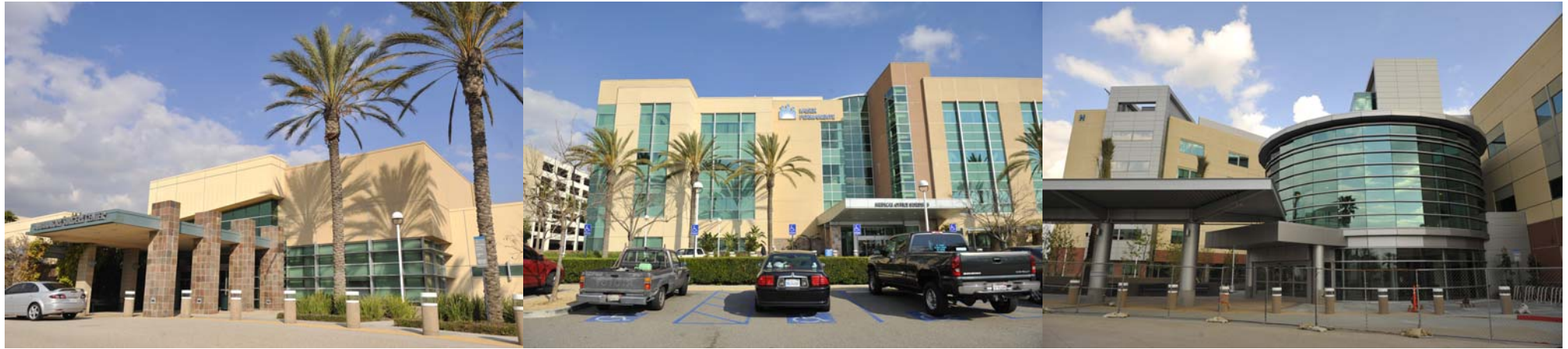
Kaiser Permanente, Ontario-Vineyard – Ontario CA