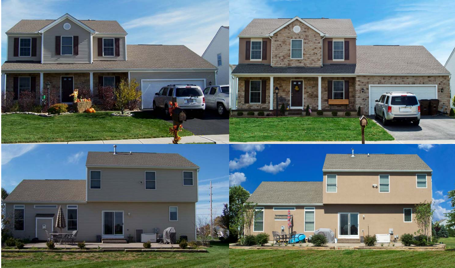
Residence Retrofit Project – Pickerington, Ohio