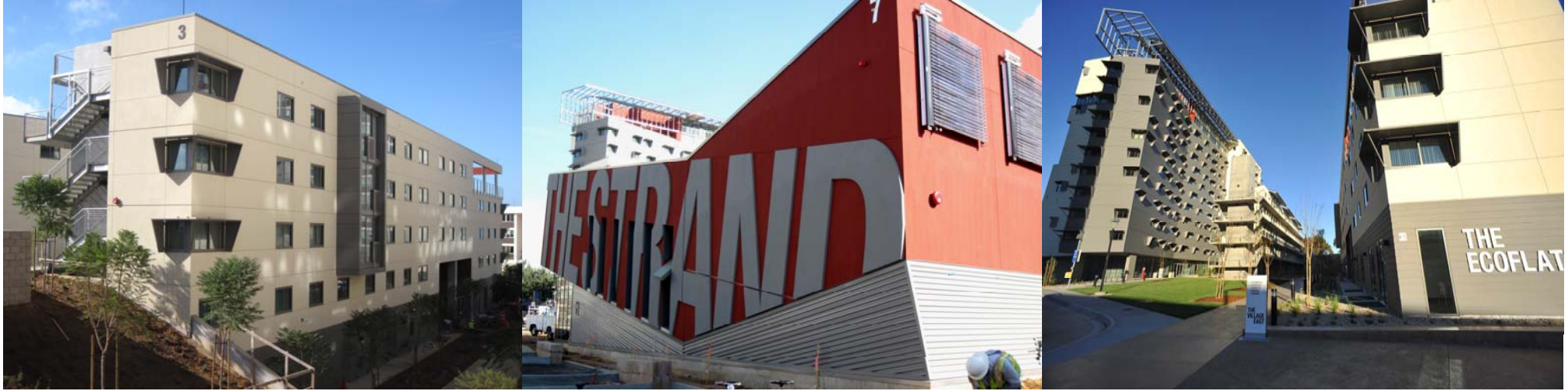
The Strand, UCSD North Campus Housing – La Jolla, CA