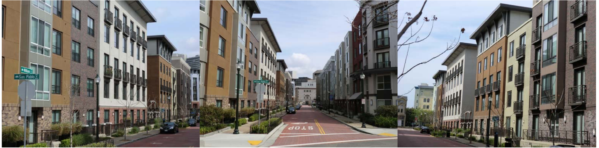
Uptown Oakland Apartments – Oakland, CA